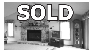
772 So. Shore Drive