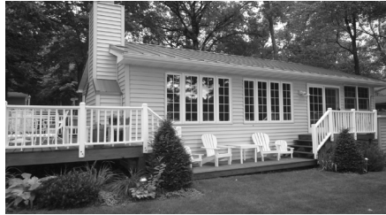
704 South Shore Drive incl. Guest House