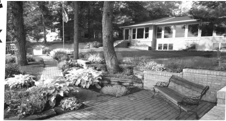
842 138th Street

WBT SOLD PROPERTIES: Since Jan. 2012 * = listed &/or sold by Lake Life Realty