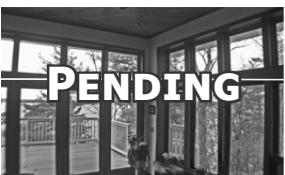
806 Flo's Court