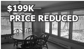
986 Sunrise Beach Dr.

937 Wallace Drive * 725 County Rd C* 730 So. Shore Drive* Pending: 780 So. Shore Drive 1389 100th Ave.* 772 So. Shore Drive* 1243 So. Shore Drive* Pending: 898 Sunrise Beach* 730 Bear Trap Lane* 766A Cty. Rd. F* Pending: 804 Flo's Ct* Pending: 690 So. Shore Drive*