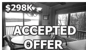
898 Sunrise Beach Dr.