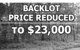
73X Bear Trap Court