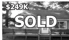
1243 So. Shore Ct.