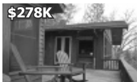
667 Bear Trap Court