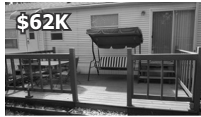
138th Street - Unit 47