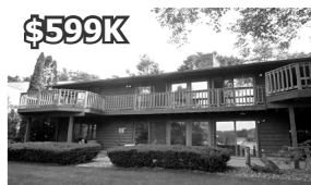
1161 Jeans Lane