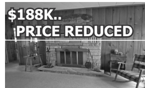
736 So. Shore Drive