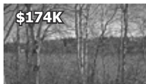
672 So. Shore Drive