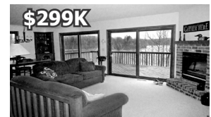
984 Sunrise Beach Dr