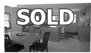
730 So. Shore Dr.